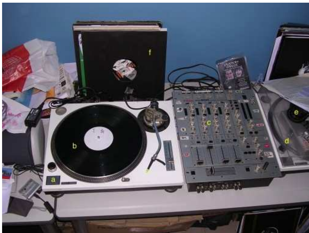
Figure 2 Xiao Deng's home, June 2004.

Below is a picture of the desk where Xiao Deng had installed his two turntables, and where he used to practice his mixes. The turn-tables and the dj-mixer are similar to those available in the clubs at the time.