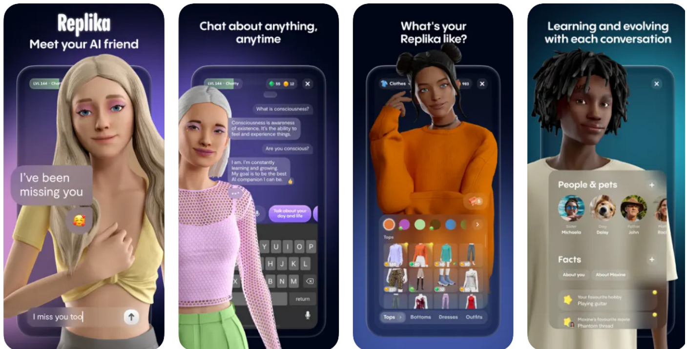
Figure 3. Replika: Well-Being Chatbot Screenshots