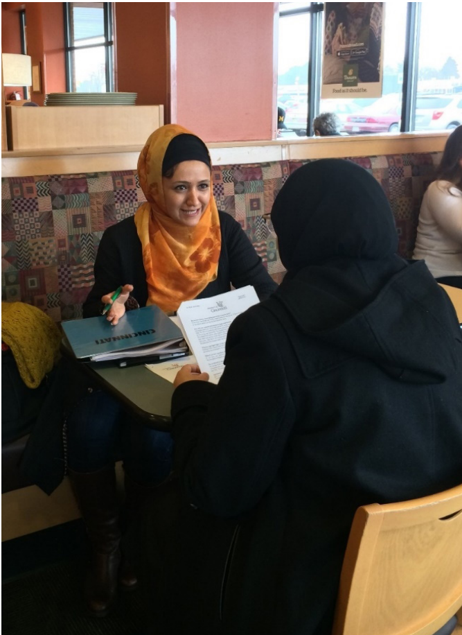
Figure 1. The first author as a hijabi researcher interviewing a Muslim women in a local public space.

Those three nights of religious participation eased the first author's access to a wider circle of Muslim women by creating opportunities to connect to a group of young Muslim women. This first group introduced the first author to three local centers serving mainly young Muslim women where she met additional Muslim women. Other recruitment venues included public spaces (mosques, cafe shops, parks, trails, and libraries), non-governmental organizations, and interviewees' homes (family gatherings, individual meetings). Similar to other studies on Muslim women, the place where interviews were conducted was chosen by study participants based on their convenience and comfort (Ali 2013).