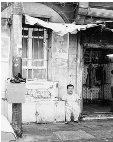
Figure 4. Foto: Aktion Mensch, 1971. A Study in the Human Body Proportions Abulmueen Al Ahmad

As you can see, the options outlined for the normal body are not available for the abnormal body. More concretely, the Contergan woman that I saw at the exhibit had no arms; only a short right-shoulder stub. Her feet were deformed at the ankles preventing her from long-distance, if any distance, movements. At the same time, her toes had an unusually high level of dexterity that allowed her to use them for reaching, grabbing, and holding, as well as manipulating held objects. Yet, if not for the electrical wheelchair, she would not have been mobile; the chair was not just a needful thing but a place that held her, suspended her body in a sitting position of a normal body. But sitting her body was not, moving in the chair freely as a child would in the adult size arms chair (we should not forget that the Contergan torso is also dwarfed). In addition to the shoulder stub, she also used her toes to move the machine and herself in it. At best, she was slouching upwards, half sitting, half-lying. In this skewed configuration, the range of her outward movements and motions was limited but not devoid of precision and grace.