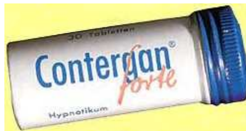
Figure 1. Contergan Hypnotikum

anticipation of an embodied human being. The person “stood” next to Ernst’s painting “The Teetering Woman”. The person’s face, haircut, and clothes indicated the female gender. I could guess her age as being about forty years old. Sunk deeply into the electrical chair, the woman was holding an audio-guide in her toes, bending toward it for better hearing. She had no arms and used her naked feet to adjust her child-like body to change the field of vision. Judging by the apparent ease with which she moved herself in the chair and, simultaneously, moved the chair, her comportment was unreflectively habitual to her; no noticeable disjunction of motility could be detected. After the guided message ended, the woman put the recorder in her lap, and, with the help of her feet, pulled herself up. Then, the short stub of her right shoulder touched the control lever and rolled the chair to the next painting. As she moved further away, I heard someone behind me whisper, “Contergan.” I inquired. The results of that inquiry were various medical, social, and psychological consequences of the condition known as Contergan. Briefly, Contergan is a specific condition caused by the drug “Contergan” that contains the active substance Thalidomid (see Figure1).