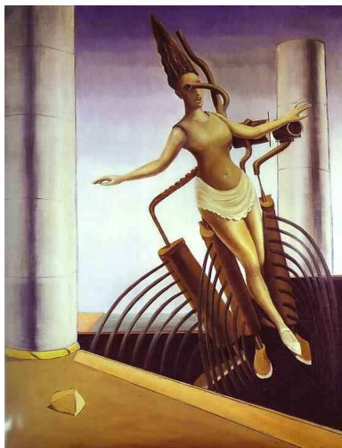
Figure 5. Max Ernst, Teetering Woman, 1923