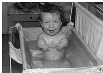
Figure 2. Contergan Baby

Thalidomid was isolated in 1956 by German chemist Heinrich Mueckler and commercialized the same year by the German pharmaceutical giant Gruenthal AG as Contergan, a tranquilizer and sleeping aid. Owing to its presumed safety and effectiveness, the drug became especially popular with pregnant women. However, having been inadequately tested, Contergan proved to be faulty, causing severe side-effects. In its fetus affective capacity, Contergan seems to be potent only during the first trimester. Between 1958 and 1961, about ten thousand deformed children were born to the drug using pregnant mothers, mostly in Germany but also in the Netherlands, Denmark, and Sweden. All the drug-induced deformities concern upper and lower extremities, spinal column, and knee joints, resulting in the condition commonly known as dwarfism (see Figure 2).