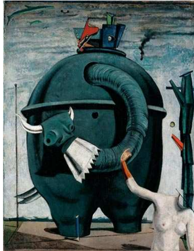
Figure 6. Max Ernst, Celebes, 1921

came to the realization that collage often lacks in the ability of creating a meaningful interface between different originally unrelated components. His new idea required a synthetic medium, a medium that would create a unified impression. But, some of the collages that immediately preceded the painting alert us to the possibility that the main constituents of the image were a female acrobat, a sleepwalker, and a machine for spreading oil on water. Ernst combined the acrobat and the sleepwalker in one image while “freezing” the oil coming out of the machine. The images were cut out from the medical, popular, and technical journals. The precursor to the teetering woman is the mechanical monster, “Celebes” (see Figure 6). xv