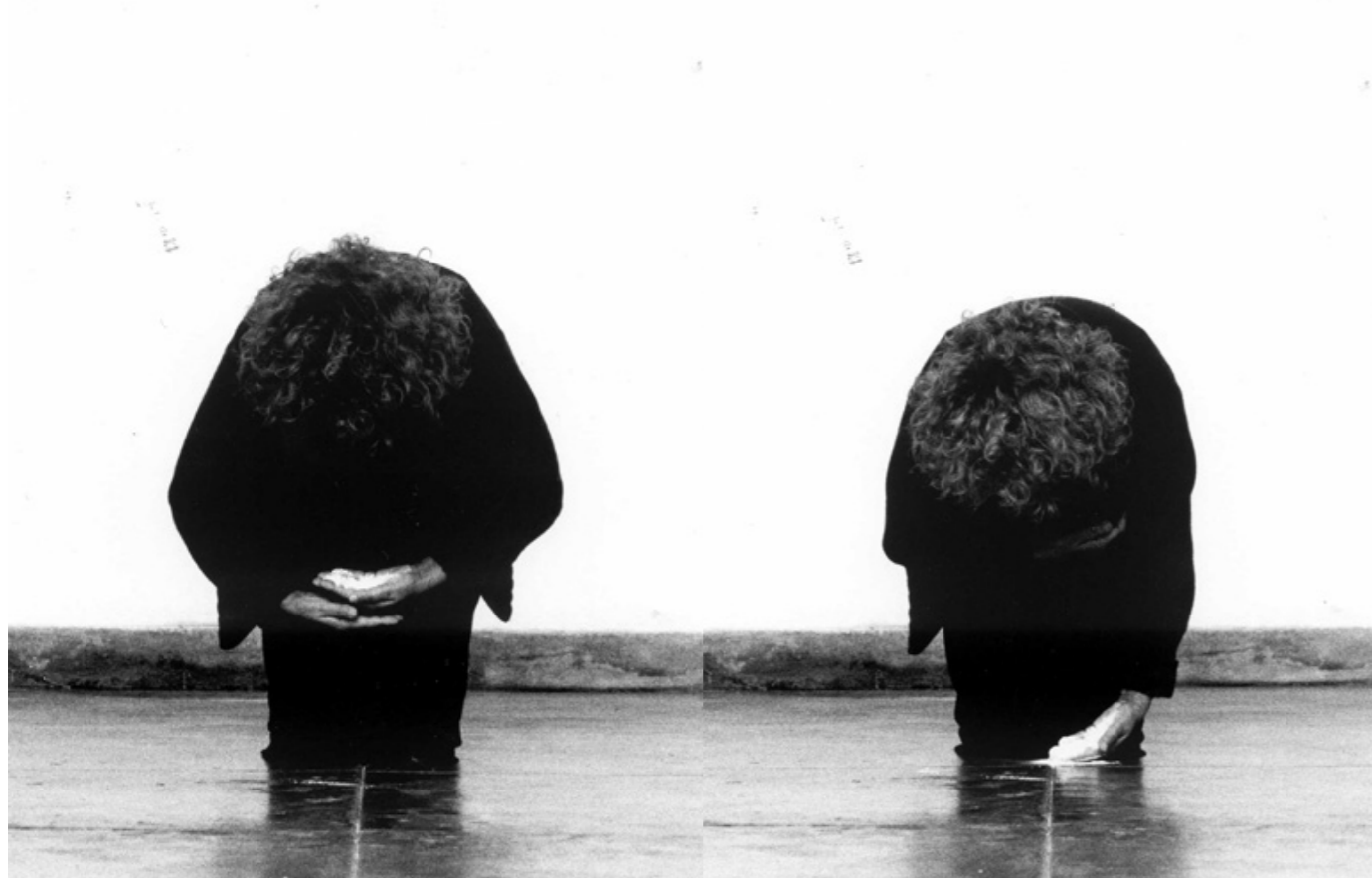
Figure 3. O Perdão I [The Forgiveness I] (2006) by Helena Almeida.

Jorge Molder's work uses all the artistic devices of classical photography: composition, subtle nuancing of black and white [and color], use of intense light and shadow, recording the intensity of an atmosphere or capturing a poetic moment. But, before these are given artistic expression they are first images in the artist's mind. The series and their titles pursue an idea, a vision; [as] nothing is in there by chance or coincidence. (Bergmann 1999:35)