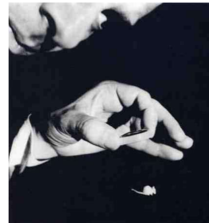
Figure 6. The Secret Agent (1991) by Jorge Molder.