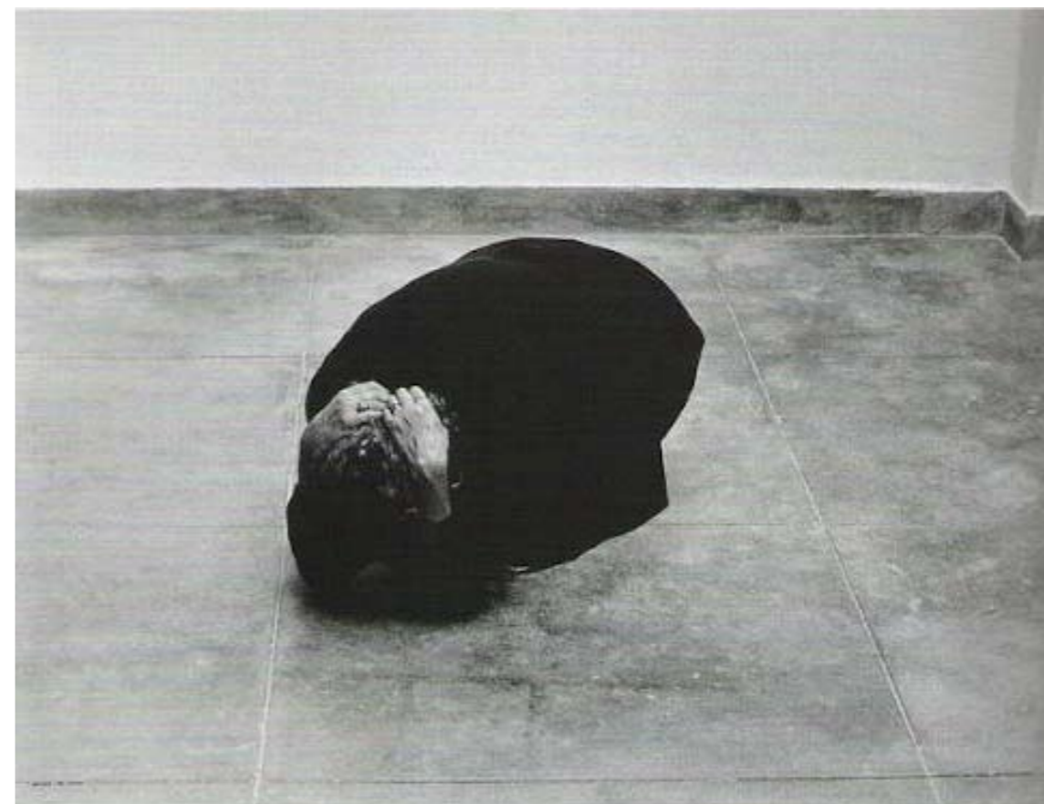
Figure 2. Dentro de mim [Inside me] (2000) by Helena Almeida.